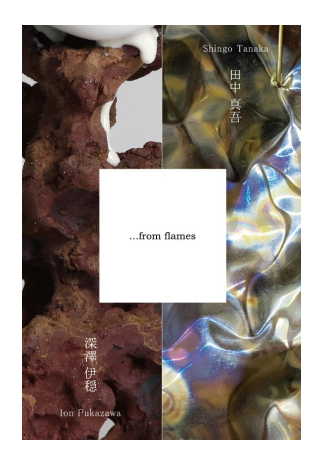
"... from flames" Shingo Tanaka | Ion Fukazawa

2024.09.01 (sun.) — 09.29 (sun.) open on fri., sat., and sun. 12:00-18:00 appointments are available on weekdays free admission